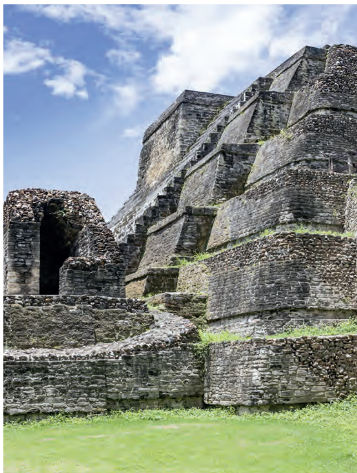
PICTURES: GETTY IMAGES/ISTOCK COLOURS; GRAFIS/ISTOCK; MODA/OCEAN; ALAMY/ALPINE GUIDE