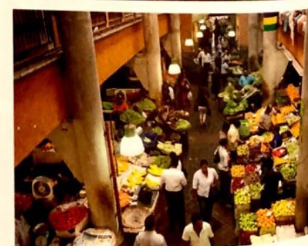
(from top) French colonial architecture in the capital, Port Louis; the Amma Tookay Kovil Hindu temple; Port Louis' bustling food market